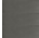
OP0 transparent varnished