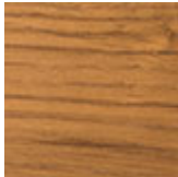
HR Heritage oak